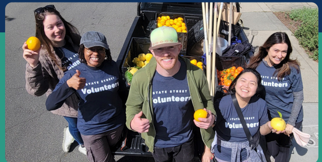
Secured funding for grassroots clean air projects including community gardens, tree plantings, e-bike classes, and more

... and Celebrated 30 Years of Service to California's Capital Region