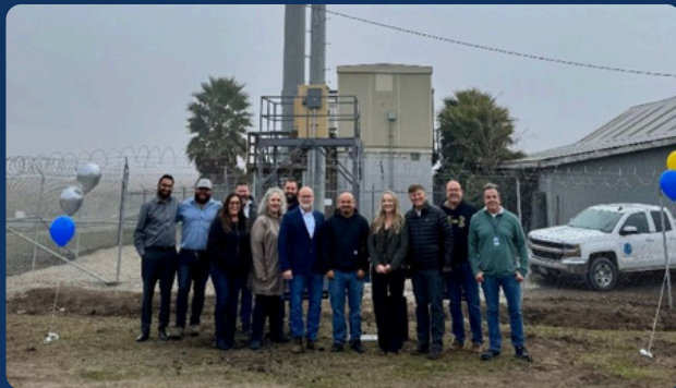
Supported new broadband tower in Isleton