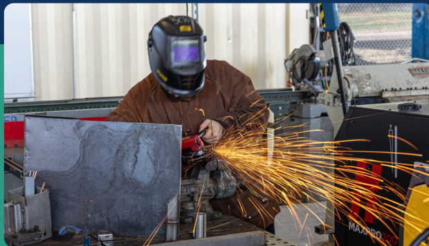
Built alignment to grow high-quality jobs