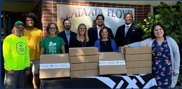
Helped provide 130 computers to students and their families at Leataata Floyd Elementary School