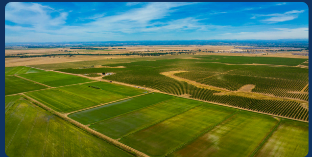
Created a 6-county rural infrastructure plan to support food resilience and inform land use decisions.